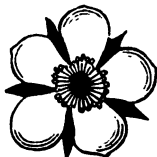
Staminate or Male Blossom.